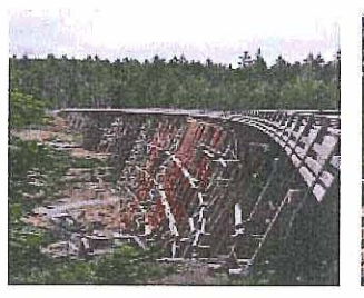
Kinsol Trestle showing rehabilitation work