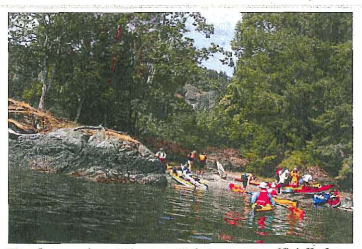
Kayakers arrive at Sansum Point, soon to officially be Cowichan's parks crown.