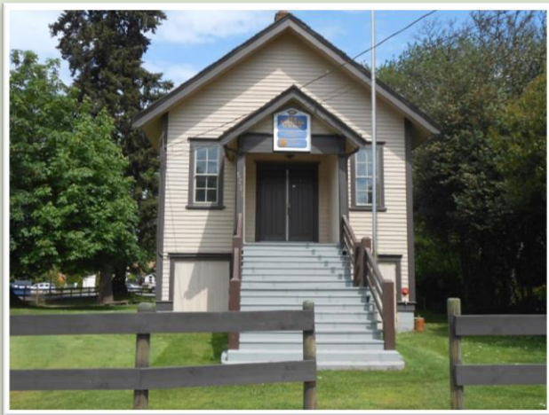
Front View of Schoolhouse