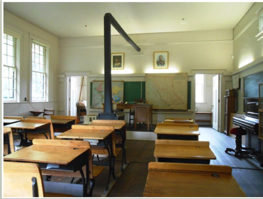
Restored Interior of the Old Koksilah School, facing the front of the school