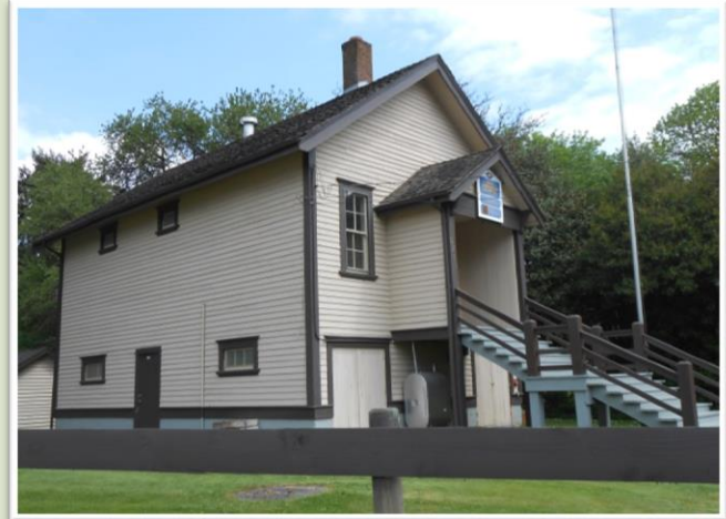
Side View of Schoolhouse