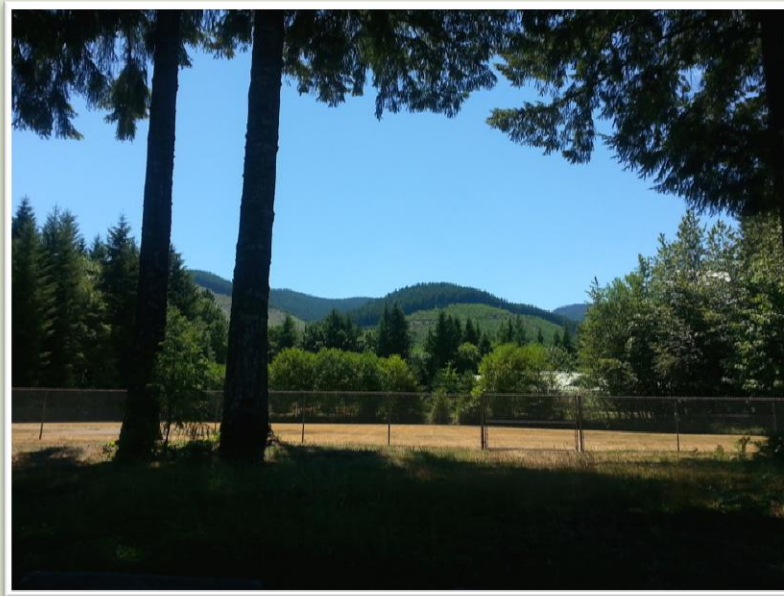
The baseball field behind the Honeymoon Bay Hall