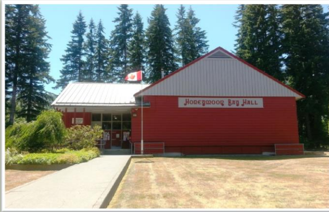
Front View of Honeymoon Bay Hall

Construction Dates: 1947-1948, 1990s, 2000s