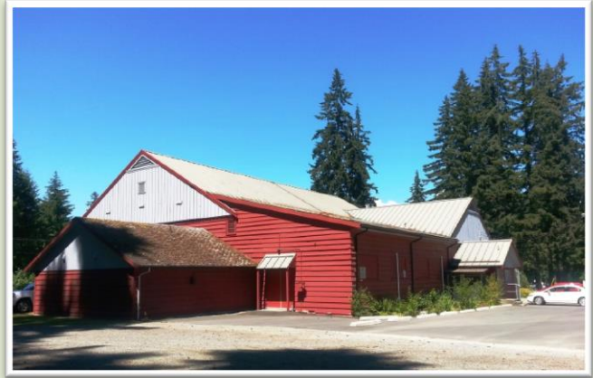
Back View of Honeymoon Bay Hall