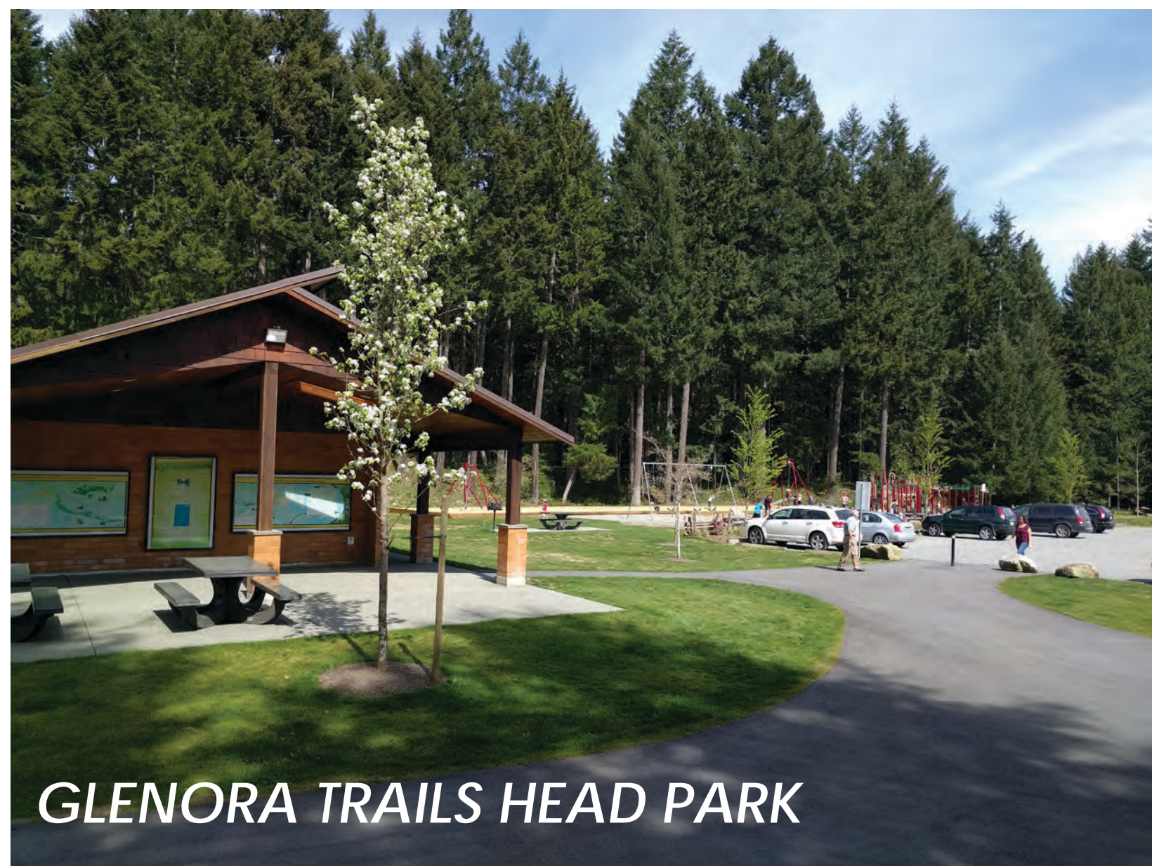
GLENORA TRAILS HEAD PARK

“The residents of Electoral Area E seek to build on the existing community parks and trails to create a connected network of ecosystems, community parks and trails that provide access to nature, diverse opportunities for social connection and outdoor recreation, while enhancing the quality of life and health of all members of the community.”