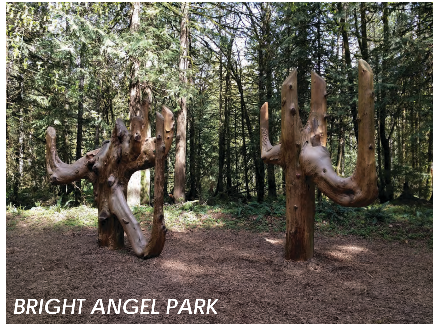
BRIGHT ANGEL PARK