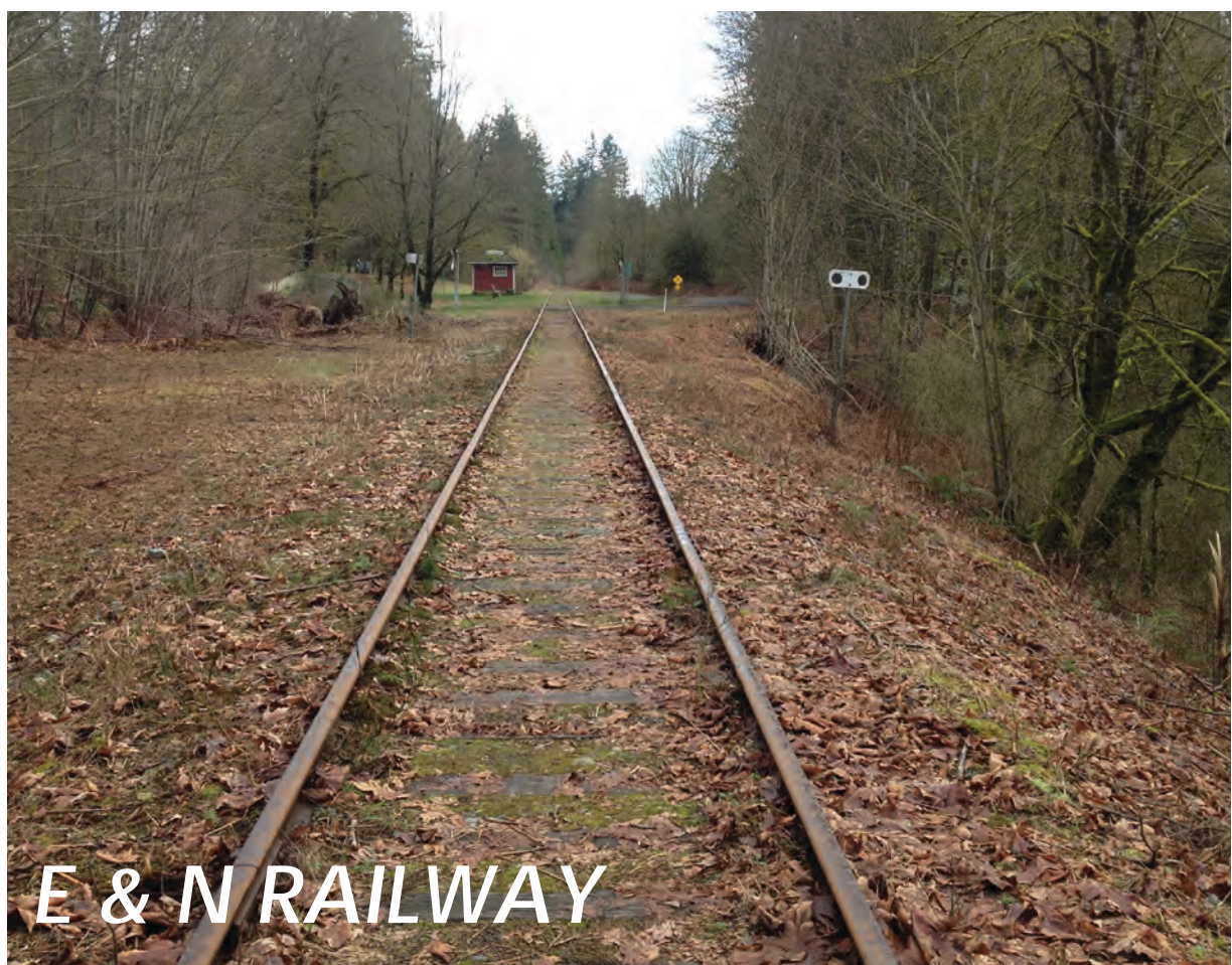
E & N RAILWAY