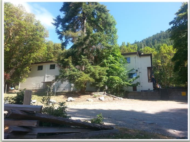
View of Youbou Community Hall from Hemlock Street