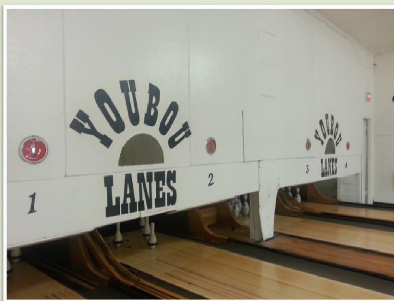
View of Youbou Lanes Signage