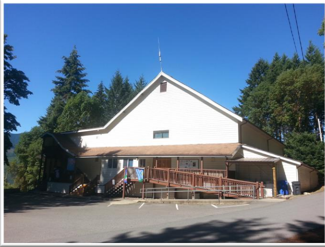
Front View of Youbou Community Hall