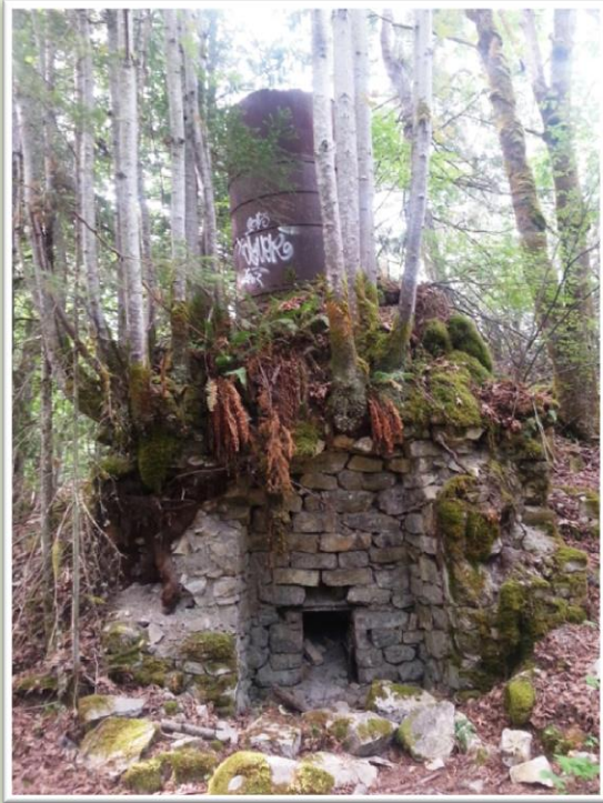
Front View of the Lime Kiln