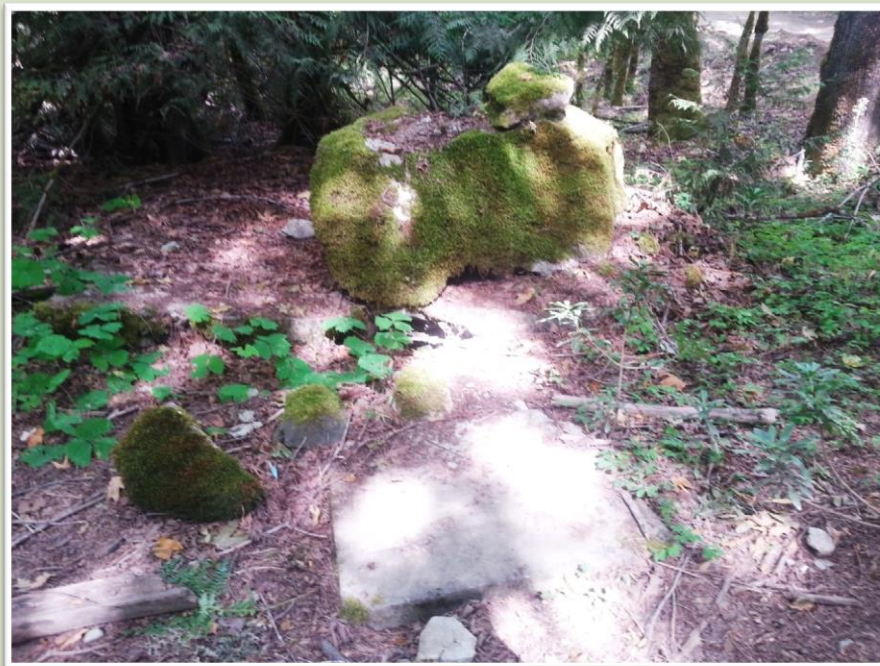
View of the Ceramic Well (covered by a cement slab)