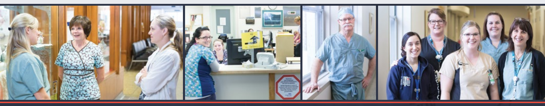
A few of the many hardworking, dedicated medical and support staff at the Cowichan District Hospita

"The mission of our network is to ensure all citizens of the Cowichan enjoy good health. A modern, innovative new hospital facility is a vital part of our region's overall well-being."