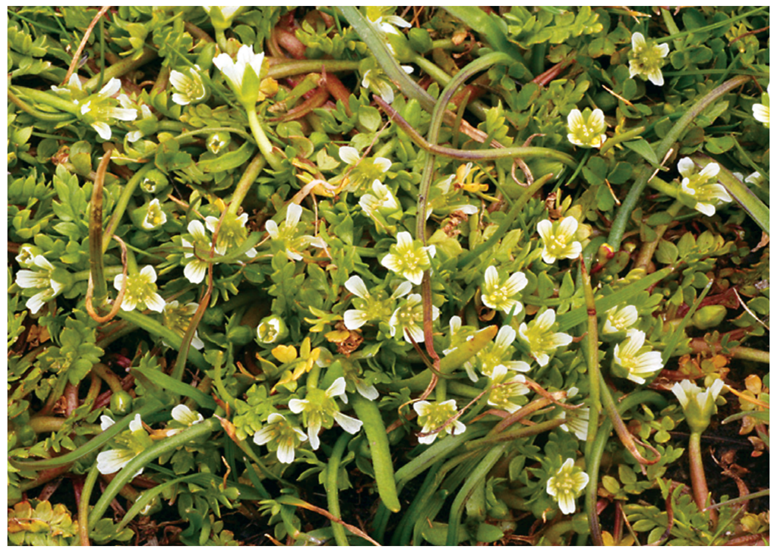
FIGURE 2.20: Macoun's meadowfoam