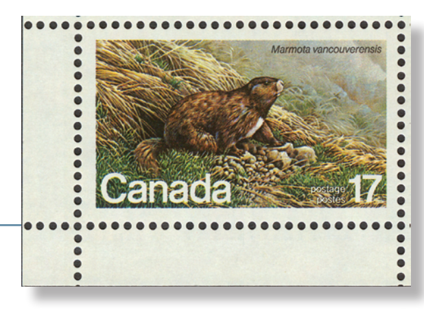
FIGURE 2.16: The at-risk marmot is one of Canada's most significant species

The Cowichan Valley Regional District is home to a significant proportion of the remaining wild population of the Vancouver Island marmot, a globally rare subspecies (Figure 2.16). It is red-listed in BC, and endemic to Vancouver Island. Unusually, compared to many of the other species of concern within the regional district, the marmot is a high-elevation species, historically living in the alpine and treeline areas, and - more recently – primarily inhabiting recently logged habitats where they are thought to be more vulnerable to predation. With the exception of Mount Washington, all known active colonies are located within five adjacent watersheds - the Nanaimo, Cowichan, Chemainus, Nitinat and Cameron River drainages - with 90% of the estimated population in the year 2000 found within this 150 km2. The CVRD obviously plays a key role in the recovery of this species (Figure 2.17).