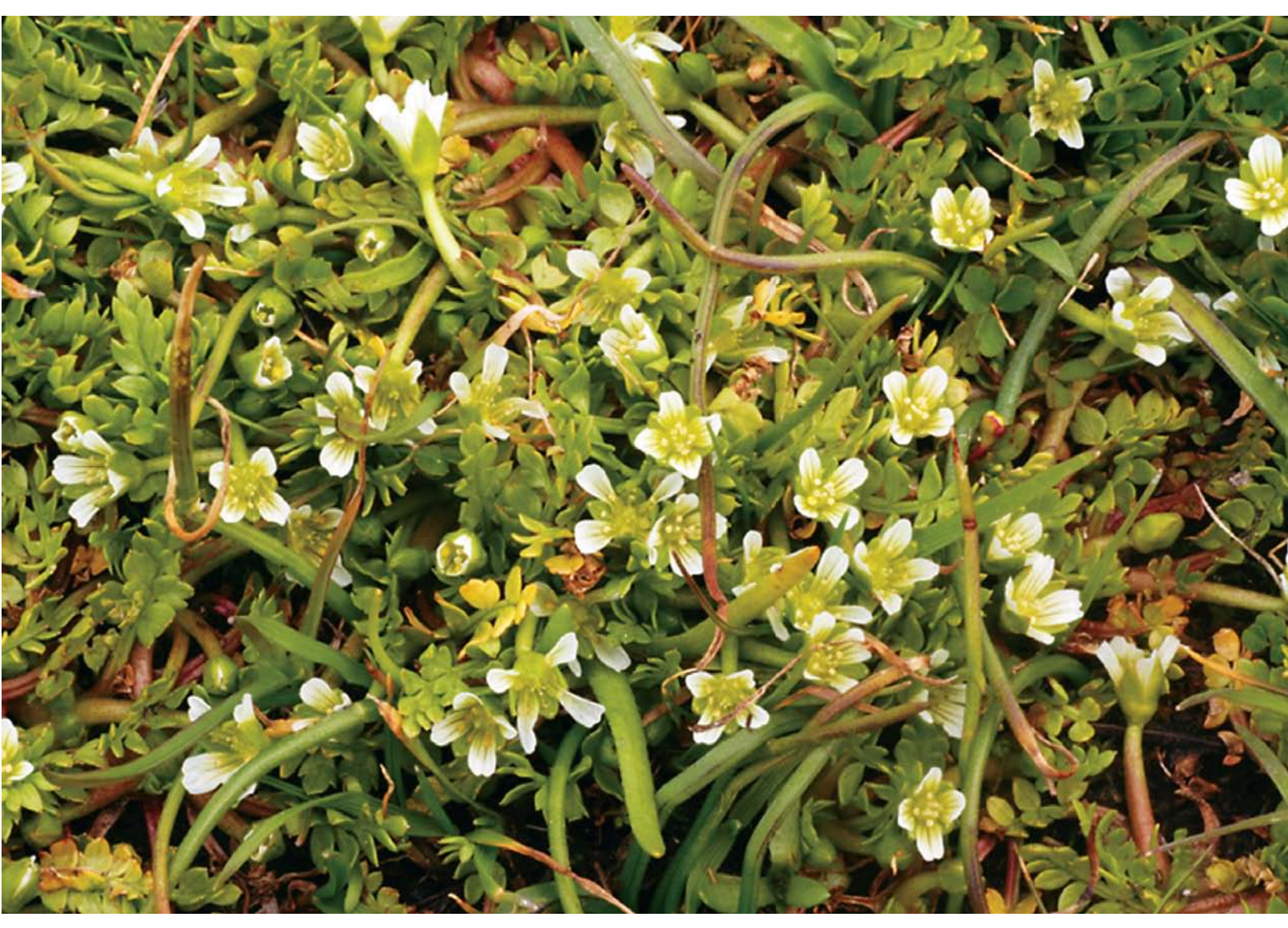
FIGURE 2.21: Macoun's meadowfoam