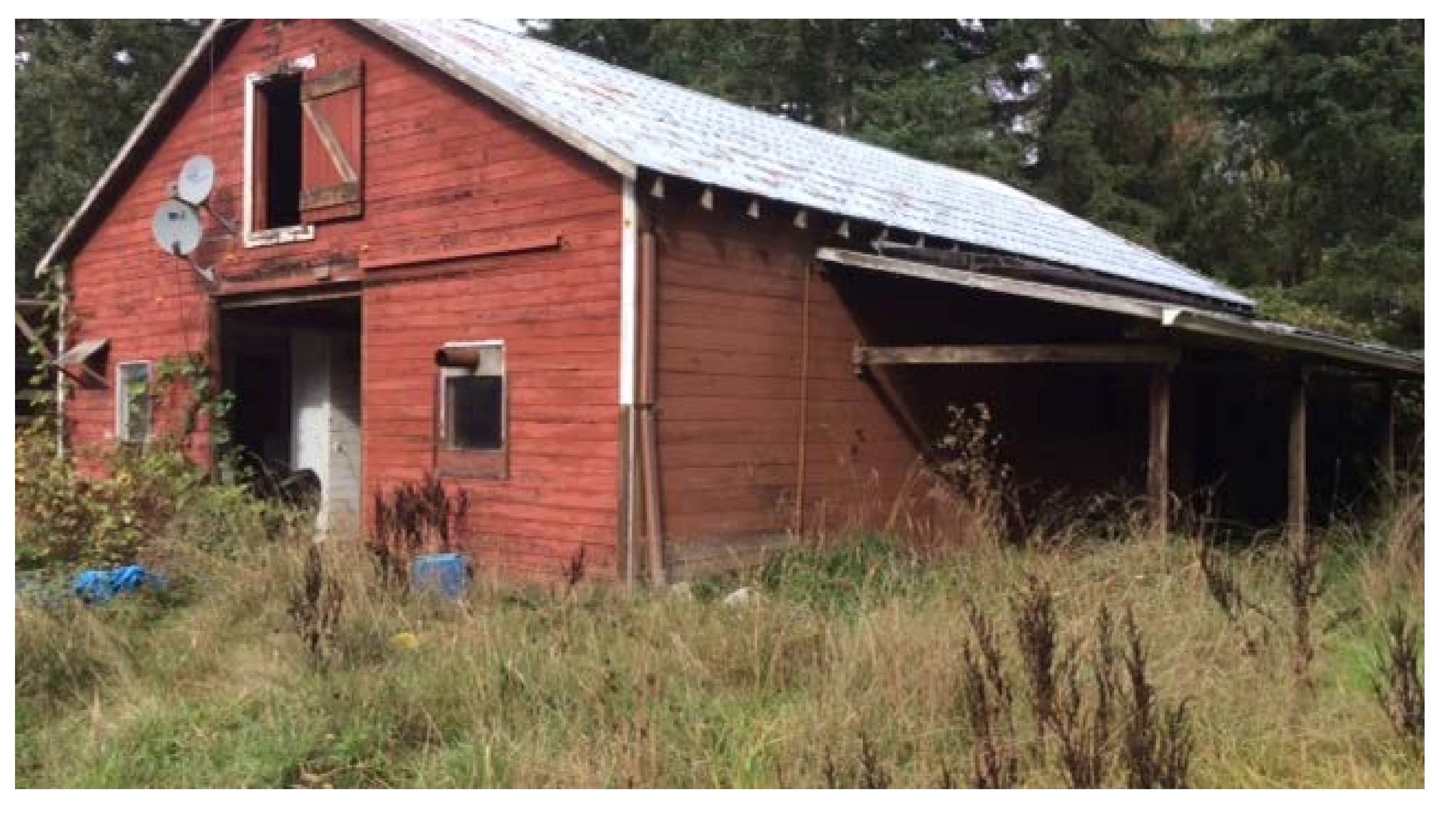
6751 - Barn (Before)