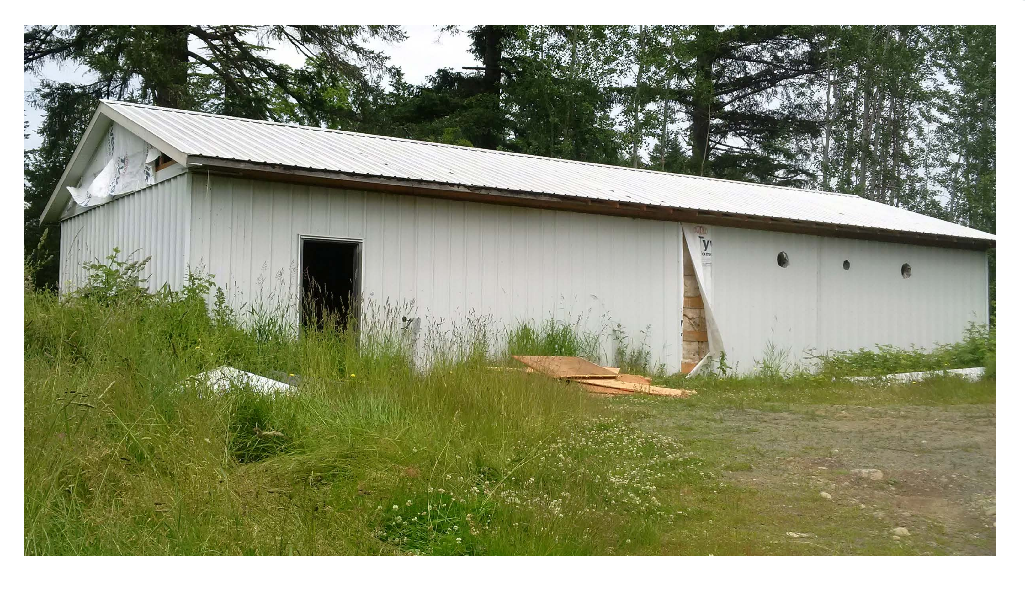
Grow Op (Before)