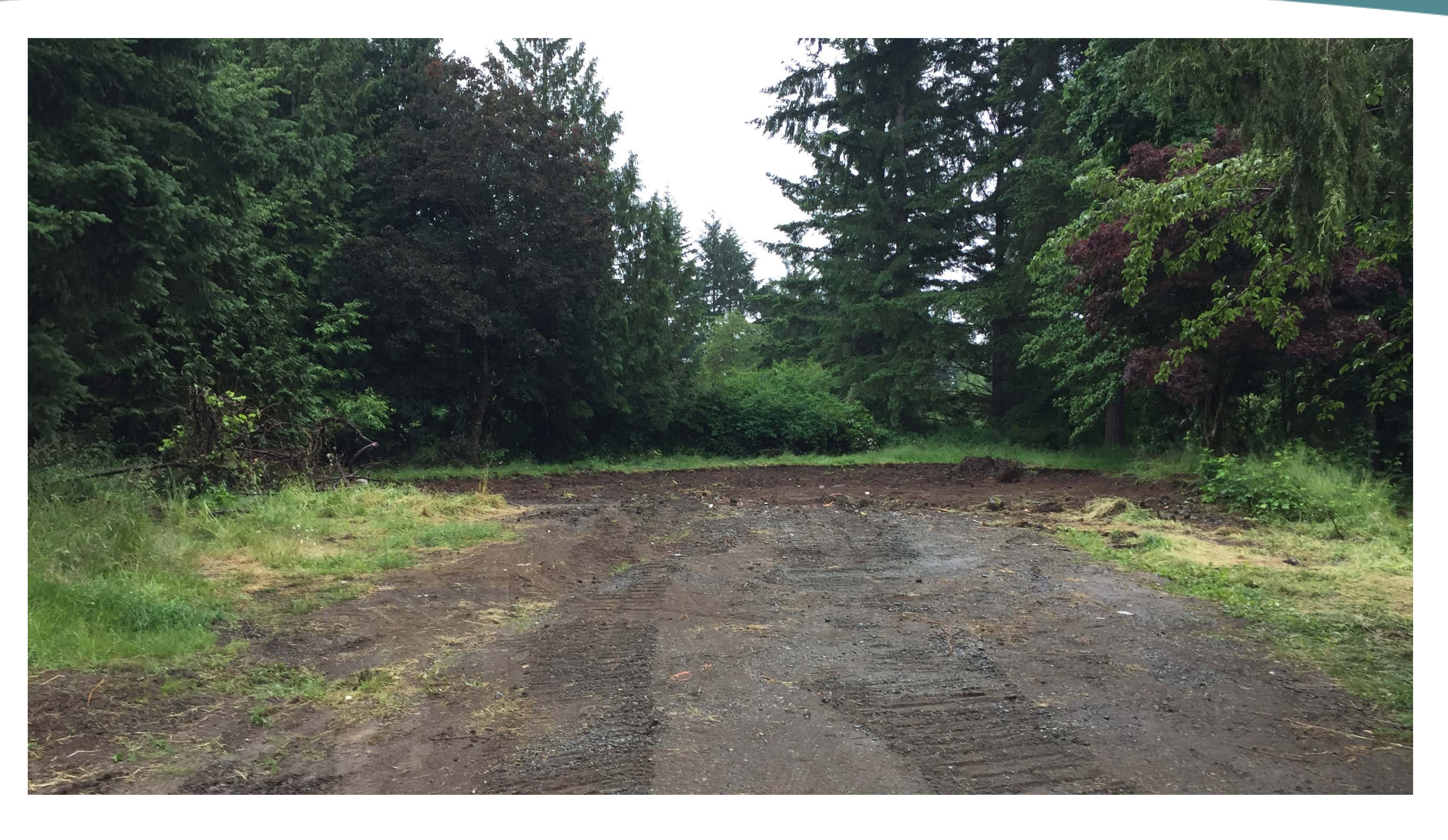
6751 – House (After)