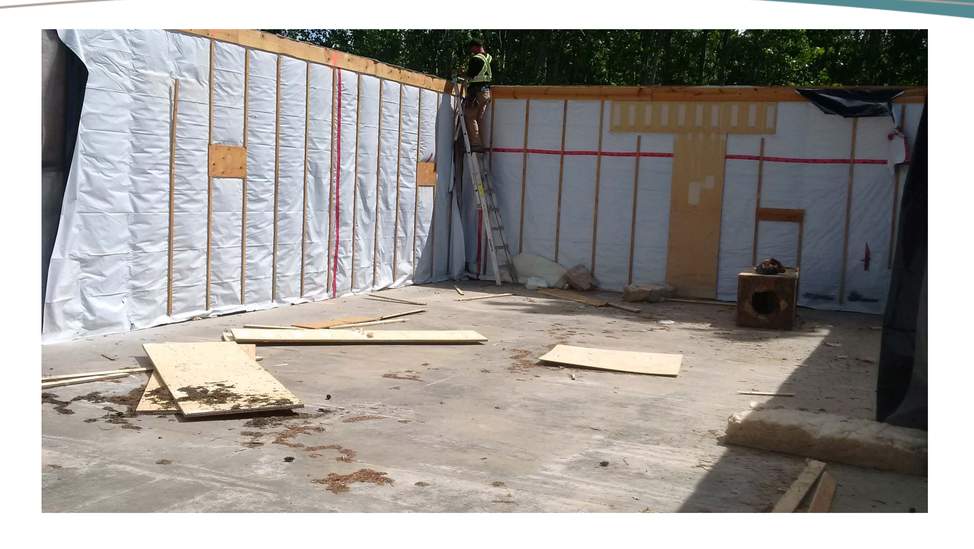
Grow Op - Deconstruct