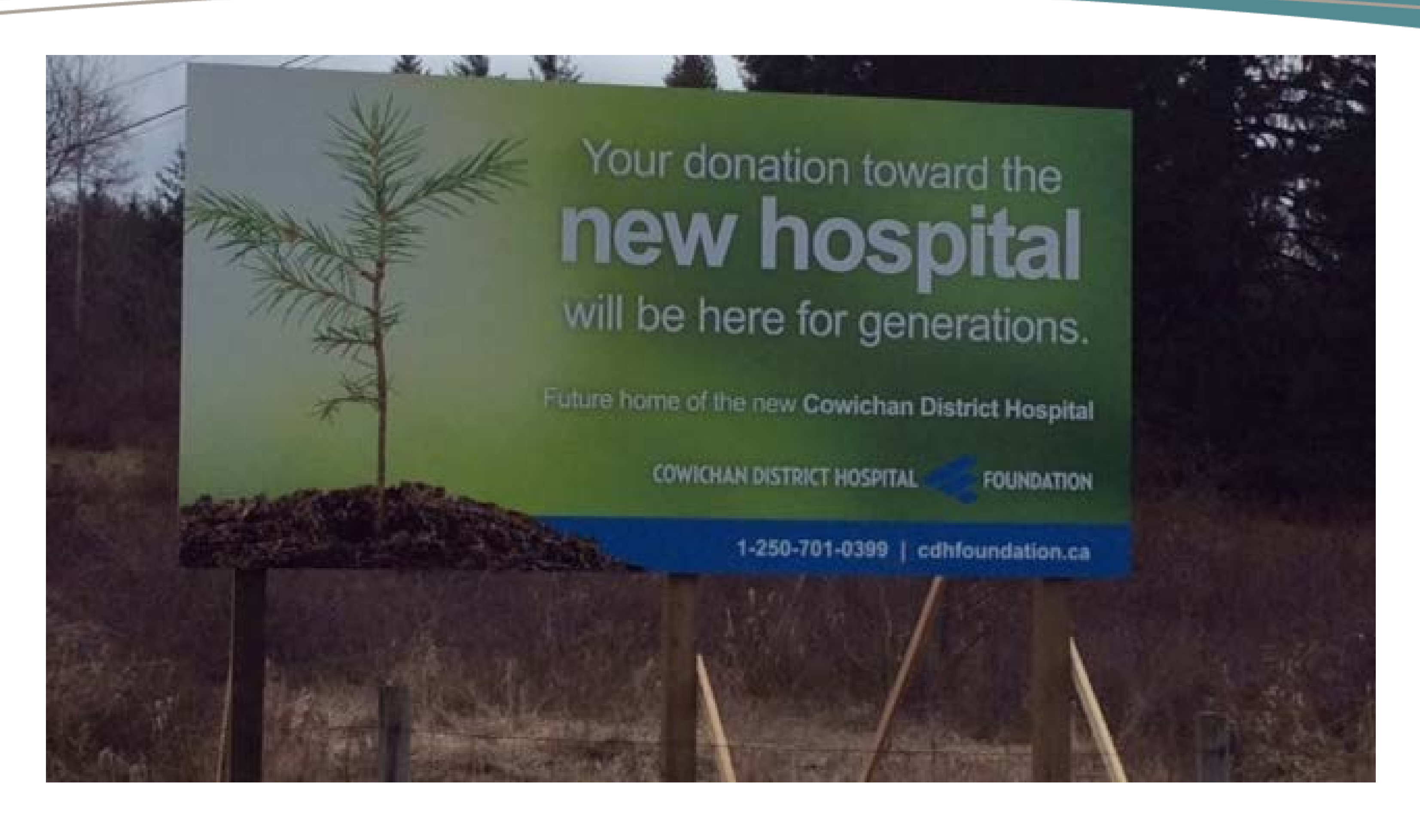
Hospital Foundation Sign