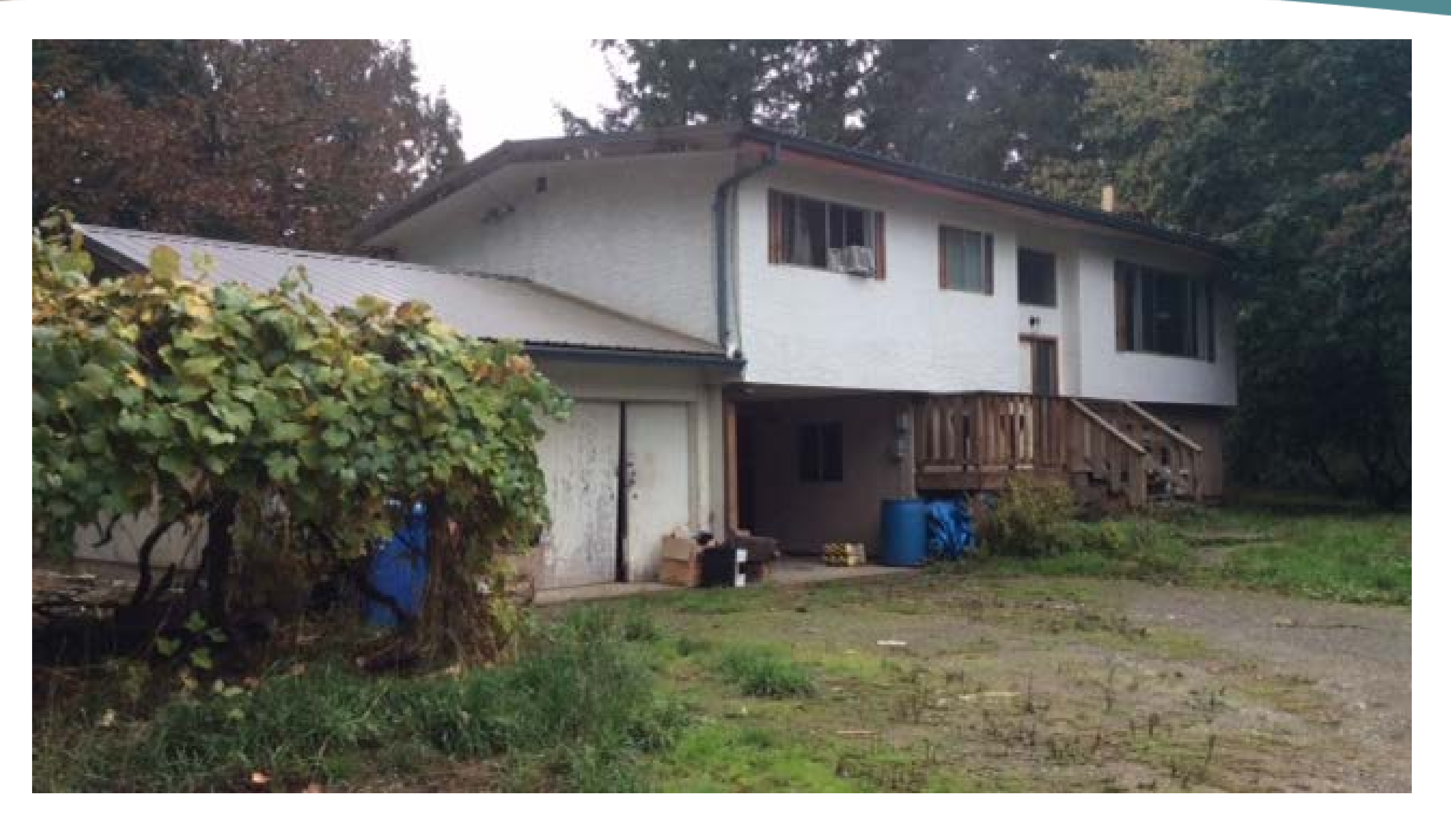
6751 – House (Before)