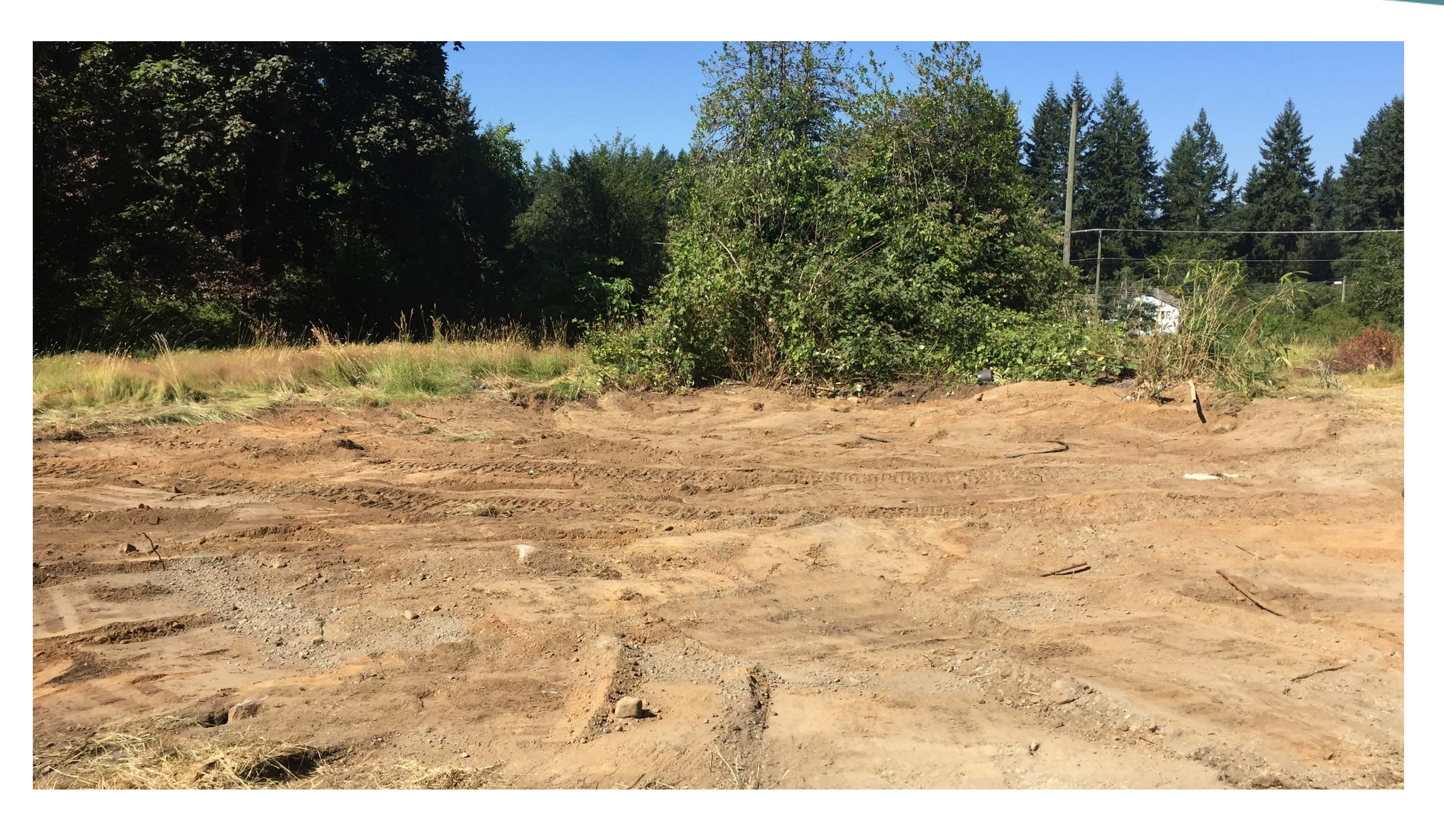
6793 – House (After)