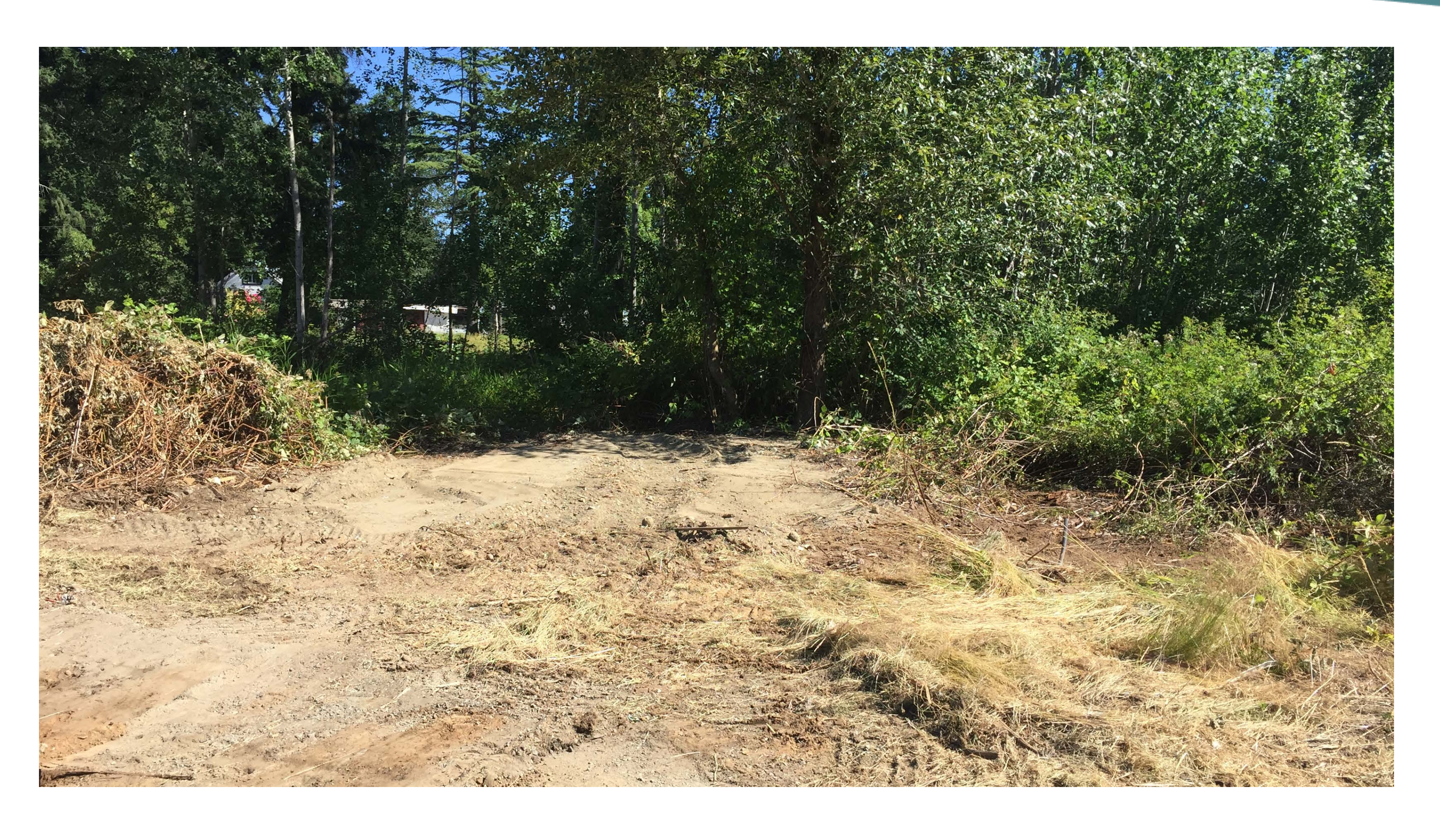
6793 - Sheds (After)