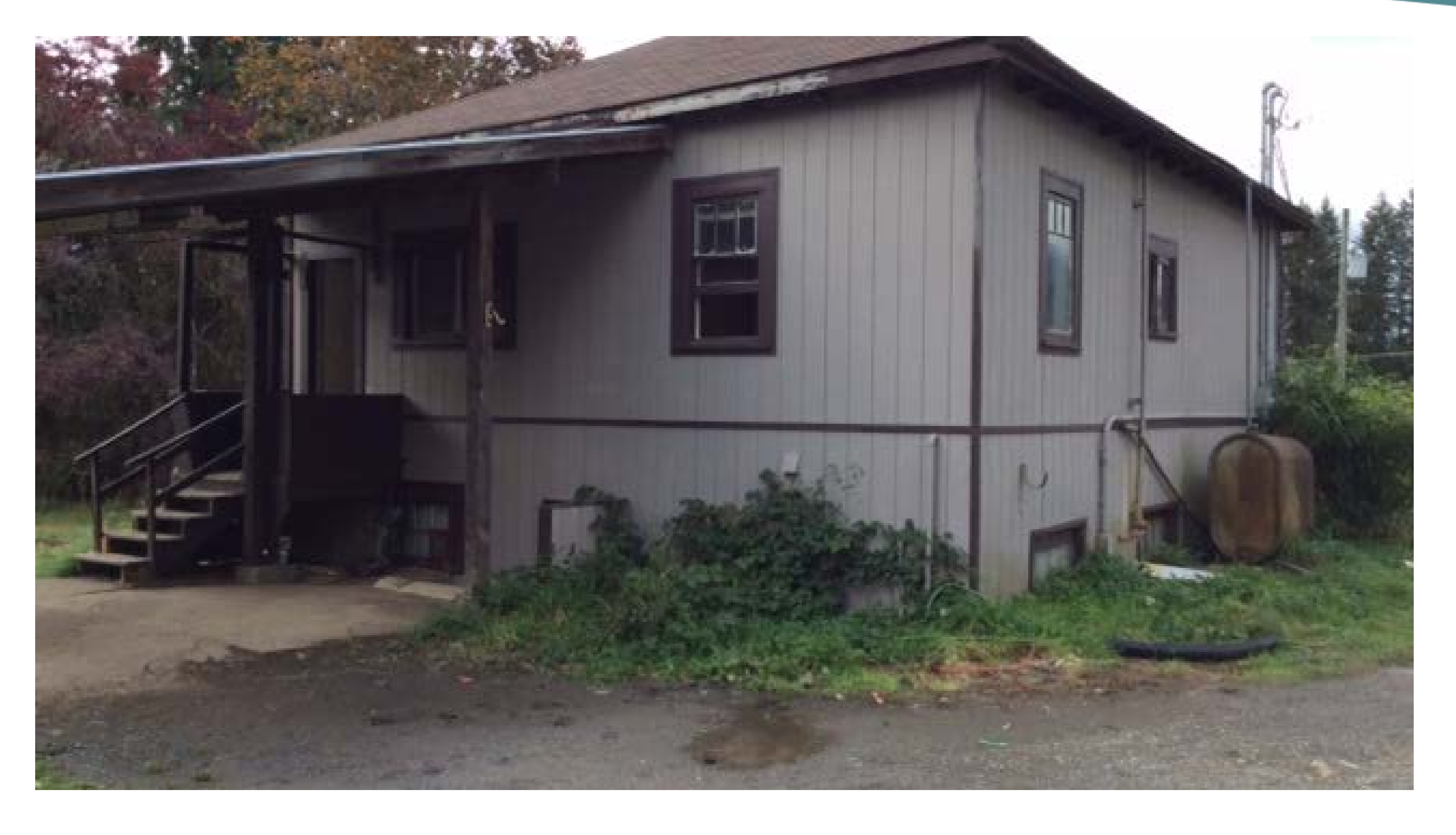
6793 - House (Before)