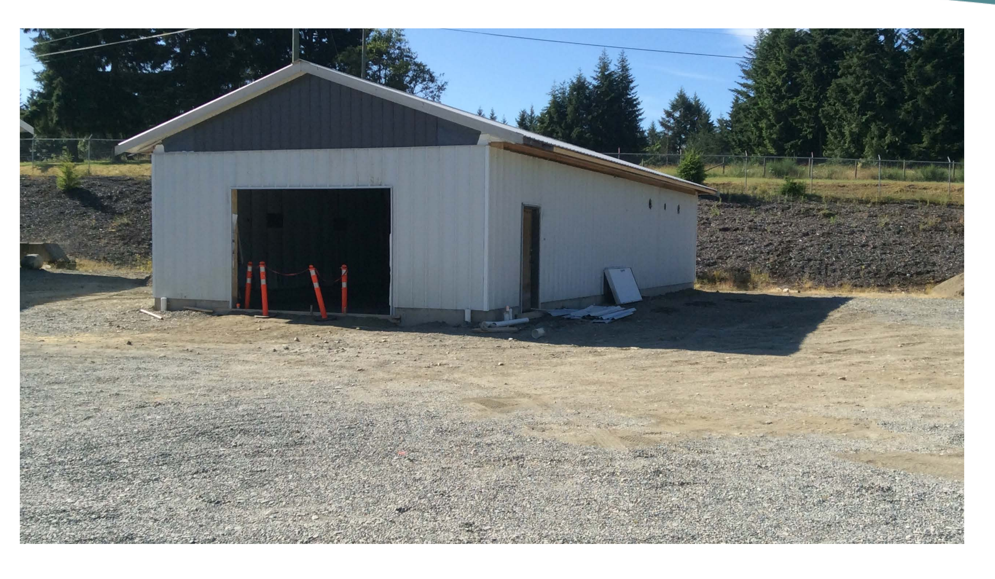
Storage Building - Complete