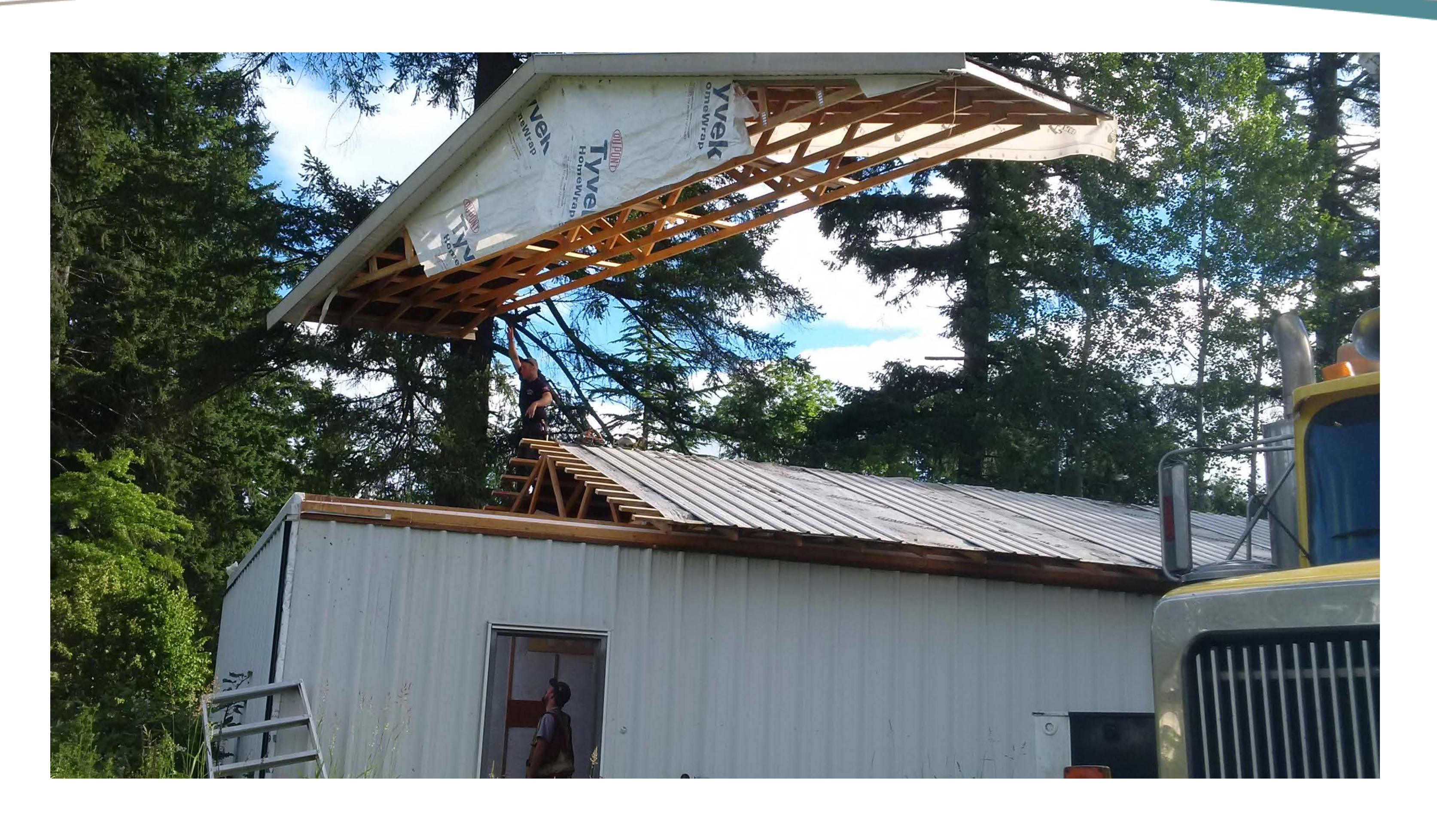
Grow Op - Deconstruct