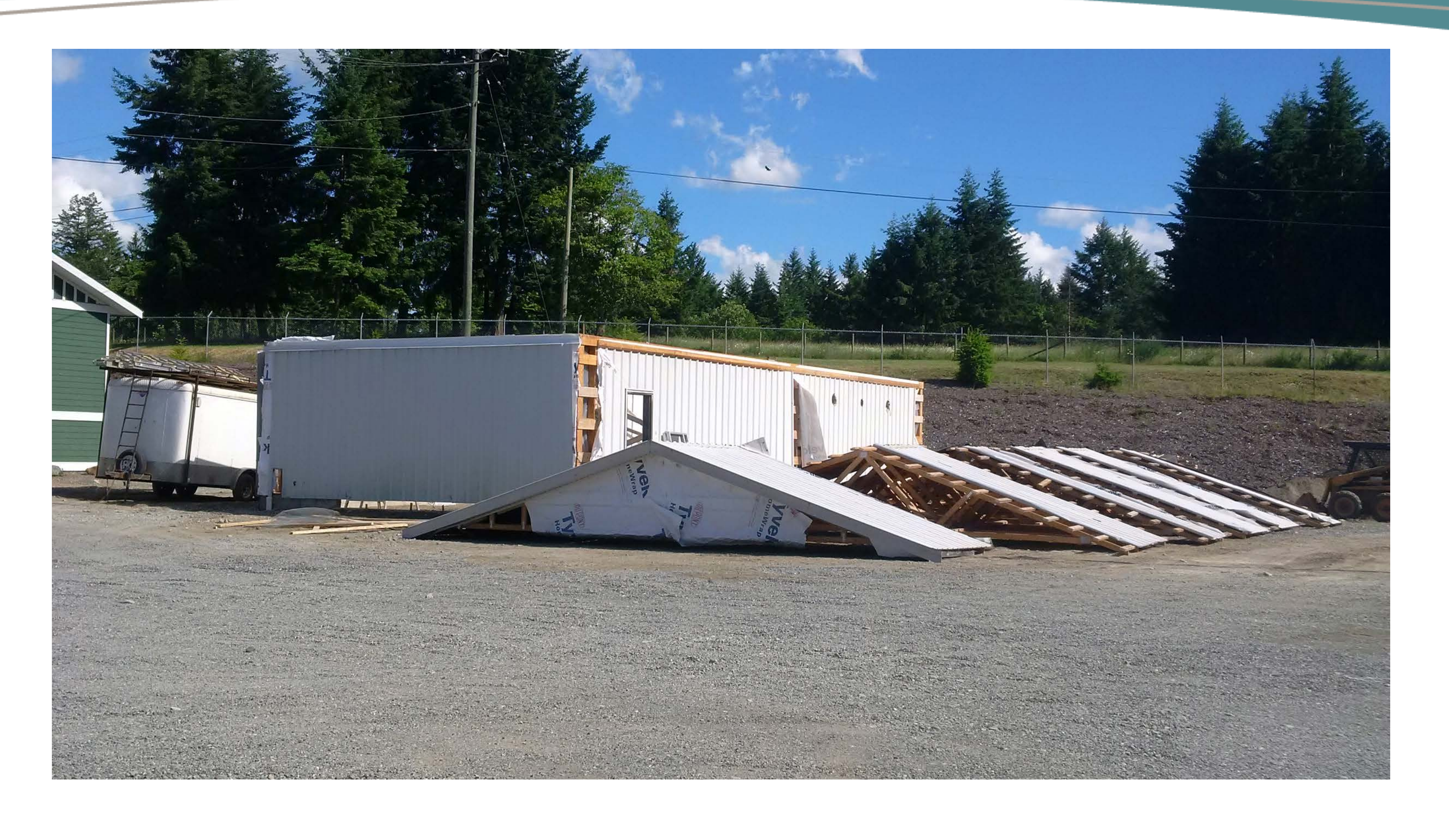
Storage Building - Rebuild