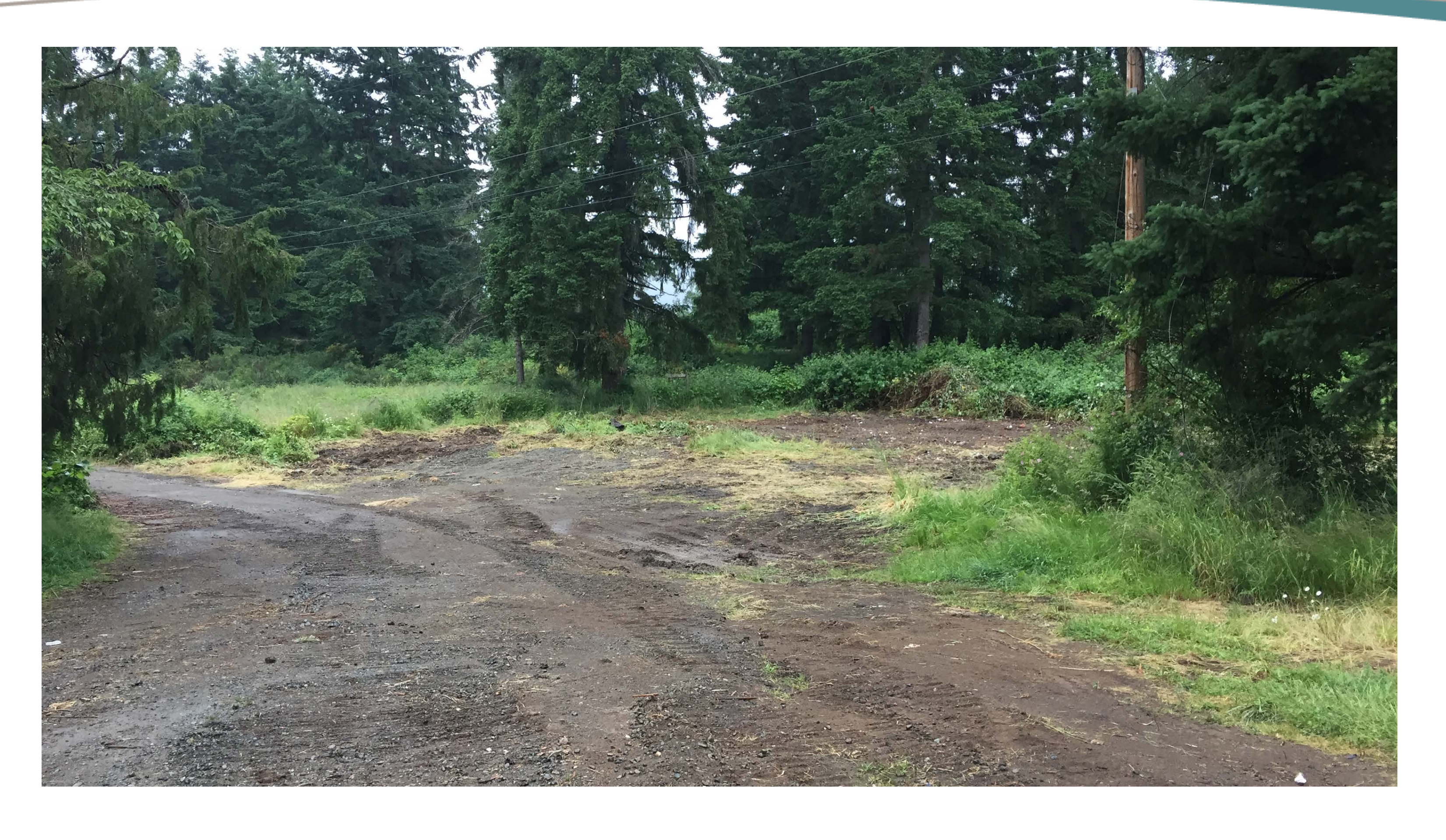
6751 - Barn (After)