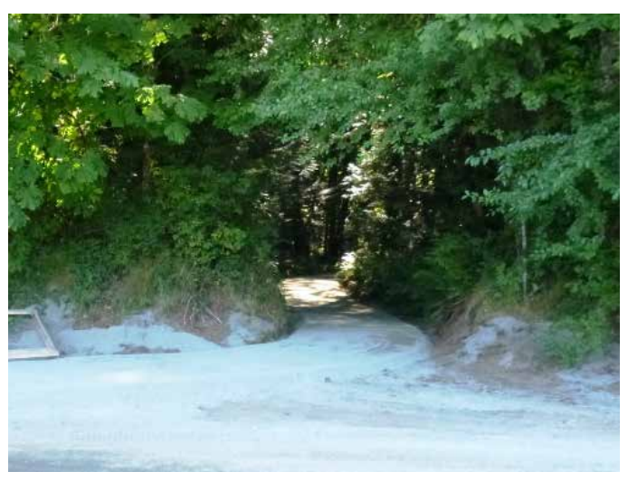
Accessible trail development.