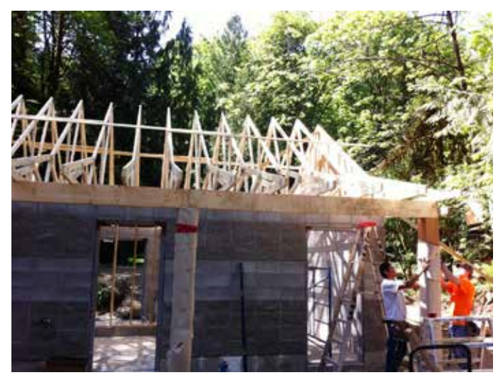
Washroom building construction.