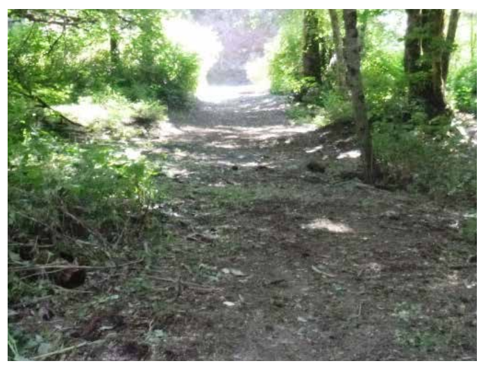
Accessible trail development.