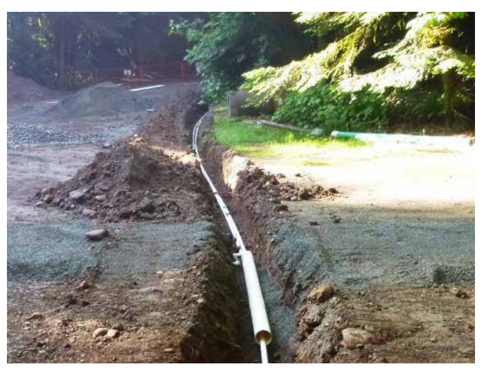
Temporary irrigation line installation.