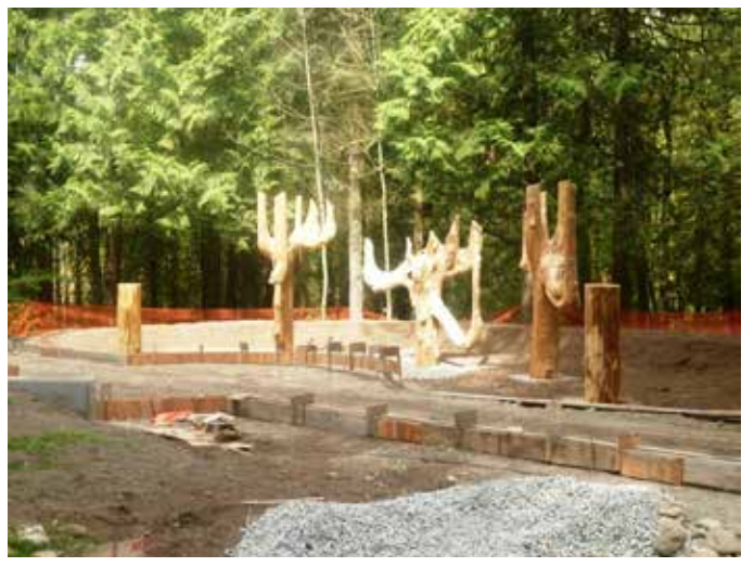
Formwork, grading and naturescape development.