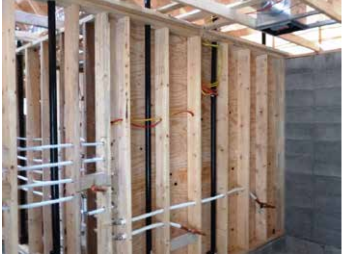
Washroom building construction.