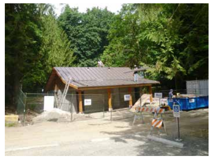
Washroom building construction.