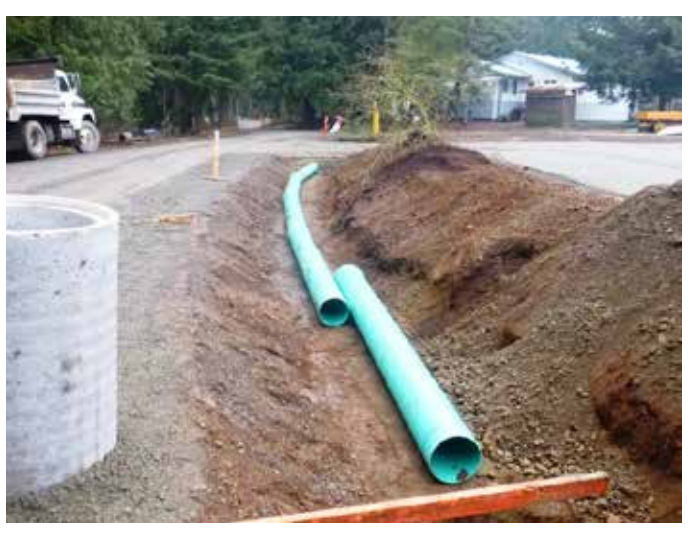
Drainage ditch adjacent to parking area.