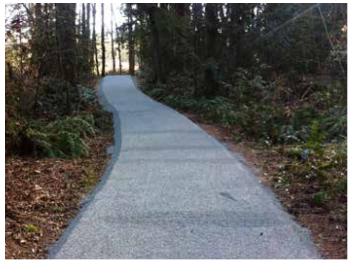
Accessible trail development.