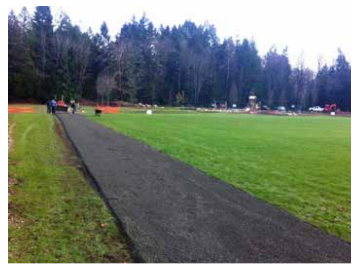
Accessible trail development.