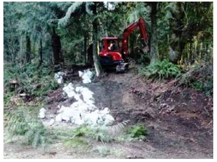
Accessible trail development.