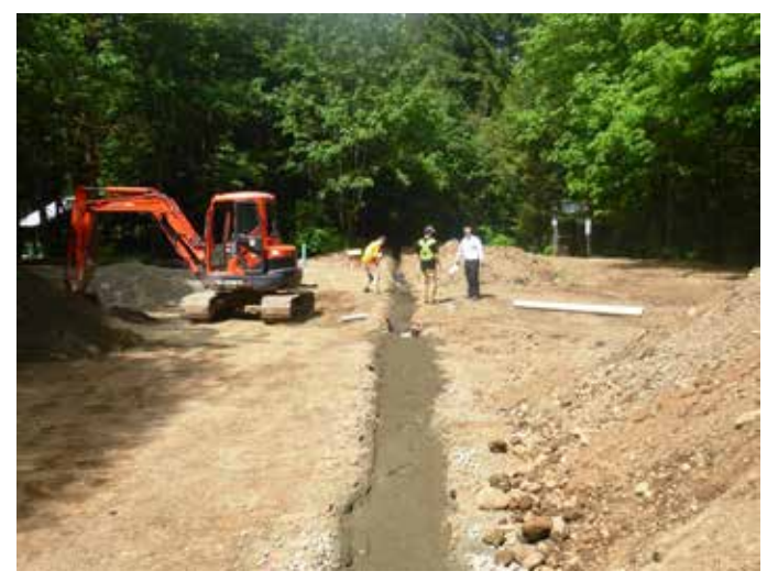
Site grading and drainage for accessible trail connection.