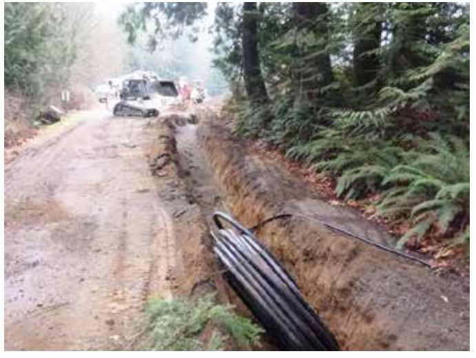
Ditch along park driveway and laying of utilities.