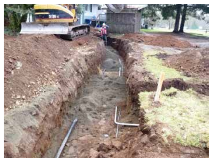
Utilities and connections to well, pump etc..