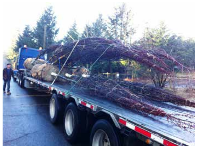
Delivery of trees for playground area.