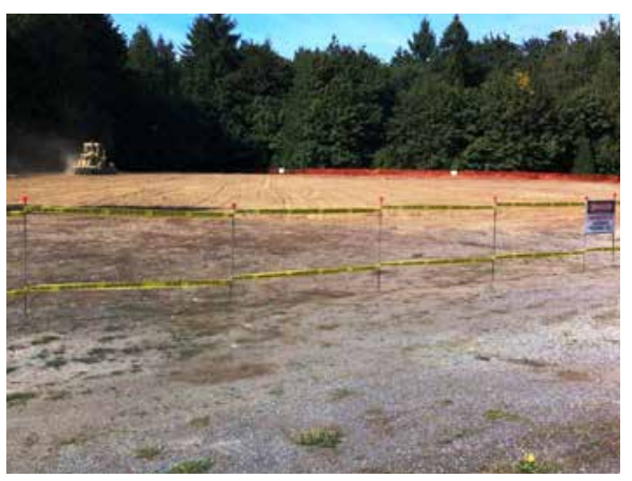
Initial grading of playfield.