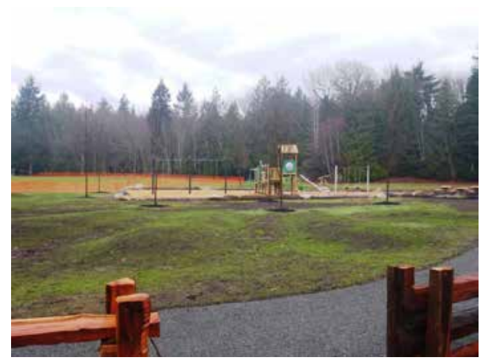
Mounding, grading and grass seeding around playground.