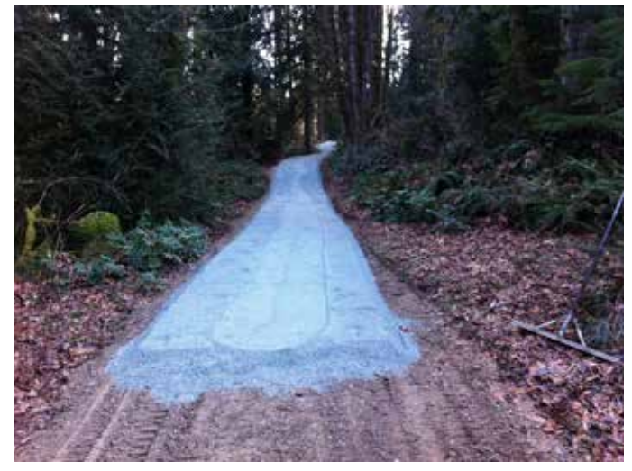
Accessible trail development.