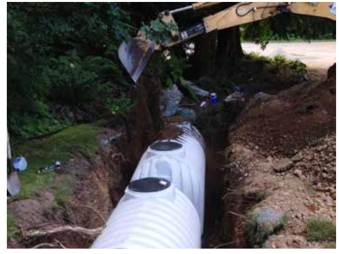
Backfilling around water storage tanks.