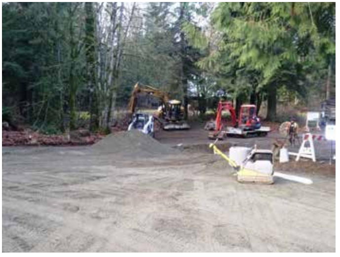
Preparing new washroom site and utilities connections.