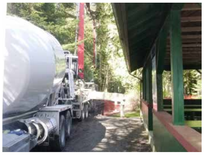
Concrete and pumper truck placing concrete at outdoor classroom/ amphitheatre