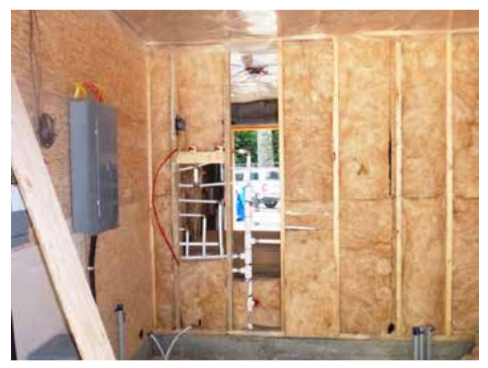
Washroom building construction.