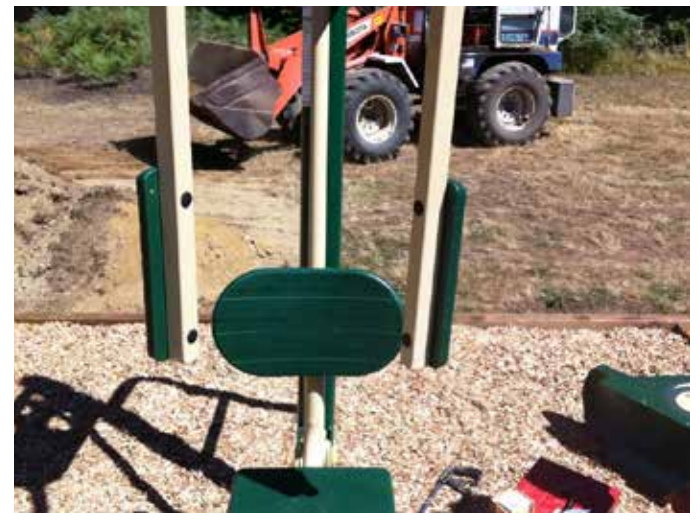
Exercise station development.