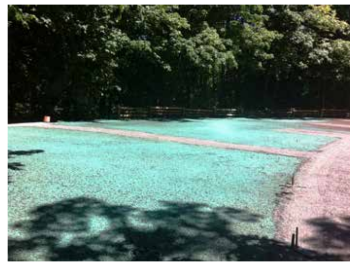
Hydroseeding adjacent to accessible trail

Site grading for accessible trail connection.