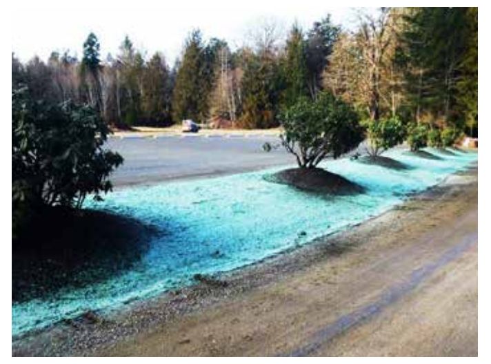
Hydroseeding on boulevard.