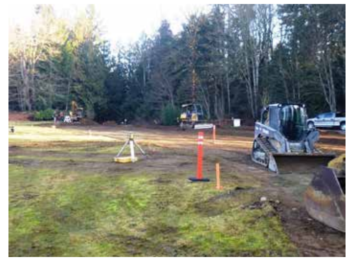
Initial utilities layout and excavation of upper parking area.