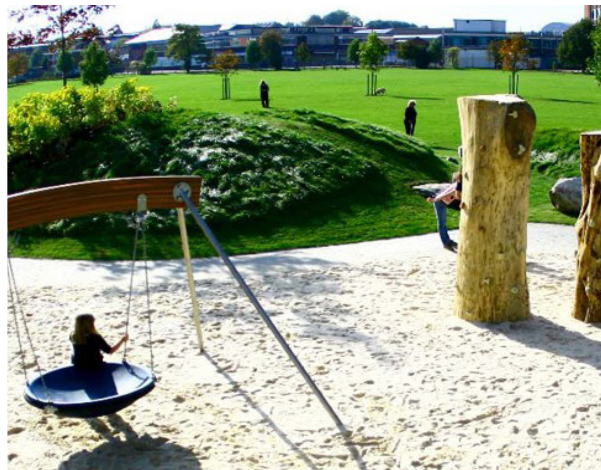
2a PLAY-SCAPE Combination of natural and traditional play materials within an undulating and vegetated landscape. Costs: $$ - $$$$