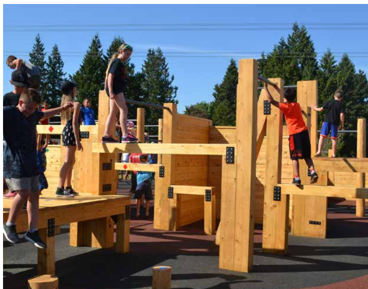
3 Parkour/Obstacle Course Custom designed Parkour play and exercise combination for all ages. Costs: $$$ - $$$$$