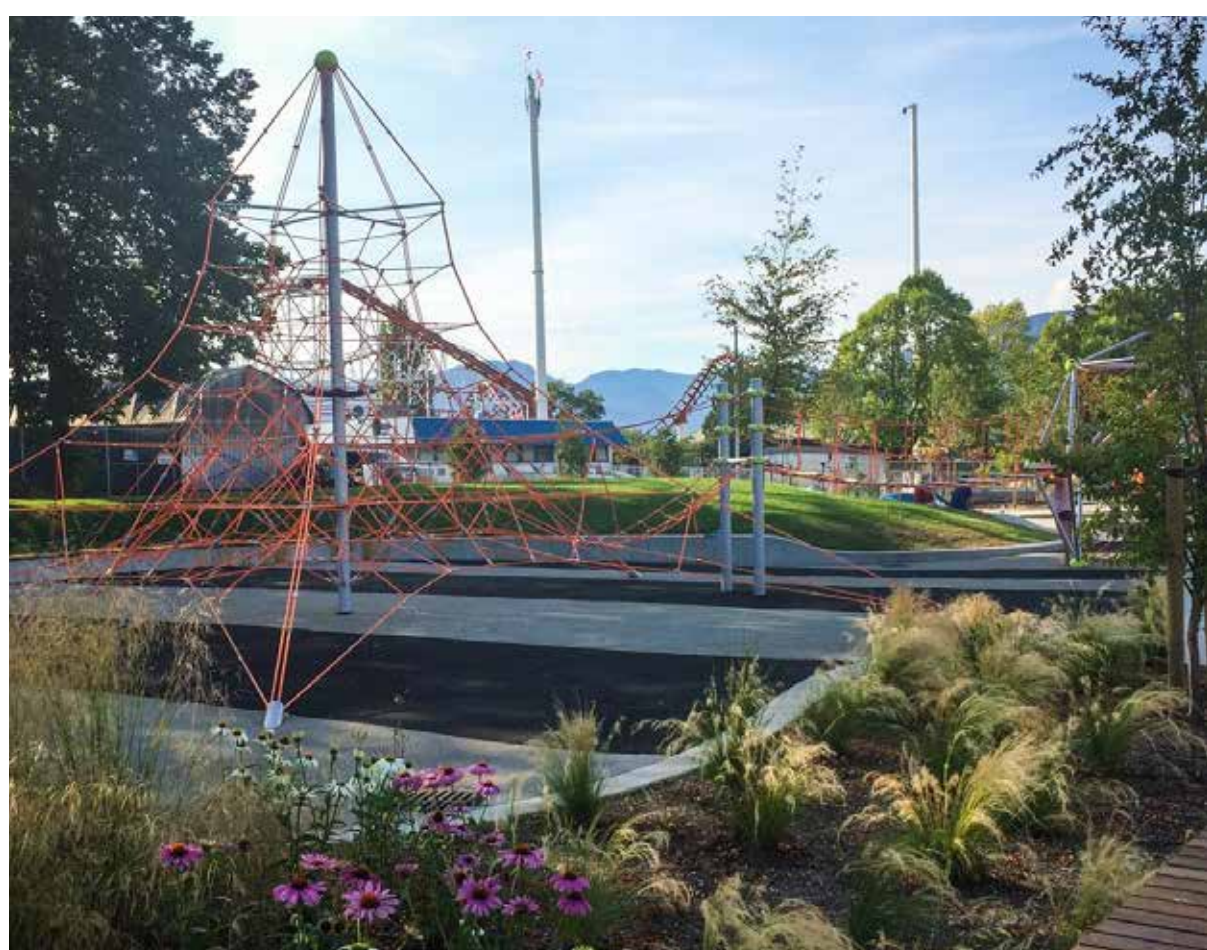
5a Traditional Play - Rope Climber Manufactured play equipment within a custom designed landscape. Costs: $$$ - $$$$$