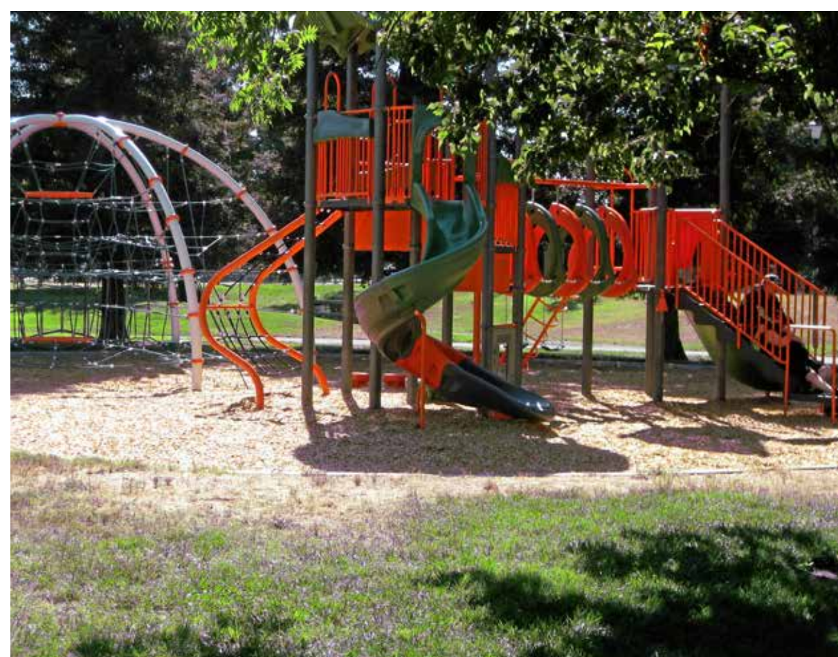
5c Traditional Play - Climber & Play Unit Manufactured play equipment within a wood fibre safety area. Costs: $$$ - $$$$$

Playground costs are dependant on many factors inclusive of size, access, materials, and tupe/style of playground. A large nature-scape can be as costly as a small manufactured playground. However, per square metre of finished playground area, nature-scapes tend to be the most inexpensive and traditional or custom design playgrounds are the most expensive.