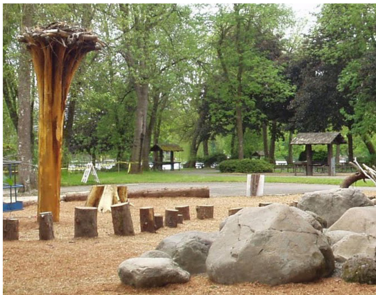
1a NATURE-SCAPE All elements are natural within a wood fiber safety area. Costs: $ - $$$

What are the interests of the Shawnigan Lake Village area community for playgrounds?