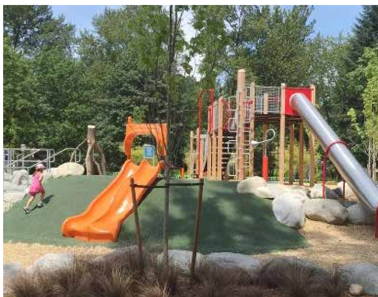
5b Traditional Play - Rope Climber Manufactured play equipment within a custom designed landscape. Costs: $$$ - $$$$$