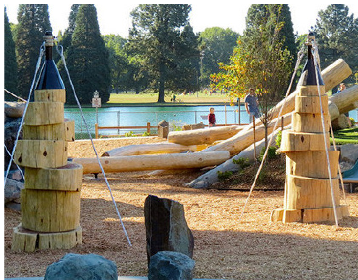
4 Engineered Play - Natural Elements Custom designed play elements constructed of natural materials. Costs: $$$ - $$$$$