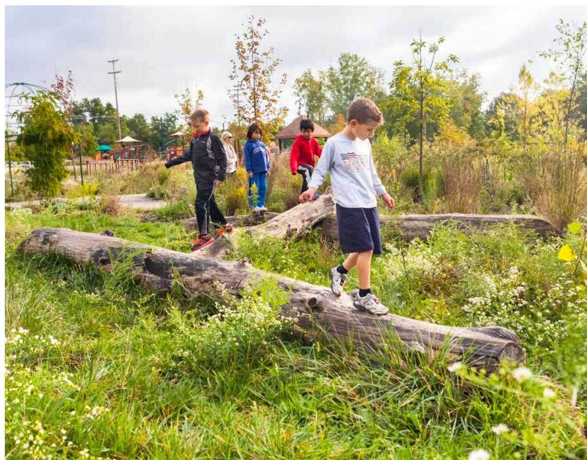
1b NATURE-SCAPE All elements are natural with focus on diverse vegetation. Costs: $ - $$$