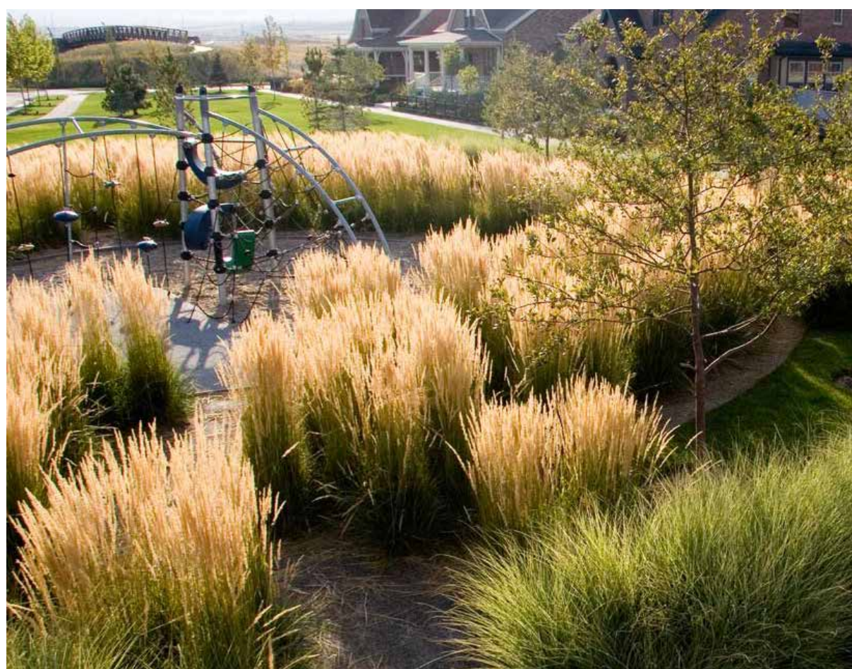
2b PLAY-SCAPE Combination of natural and traditional play materials within an undulating and vegetated landscape. Costs: $$ - $$$$